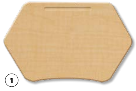
1 Virco's unique hex-shaped, contoured collaborative top makes variable groupings of 3, 4 and 6 students easy and intuitive. Tops are available in high-pressure laminate or FRW™ hard plastic. See back page for more writing surface options.