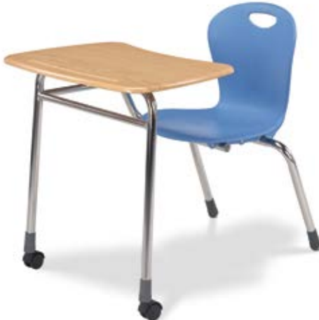
ZUMA® Agile Combo