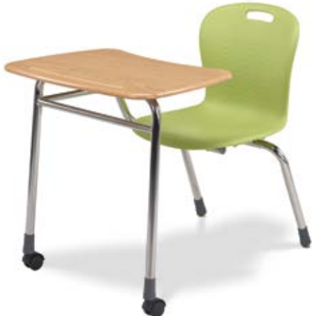
Sage™ Agile Combo