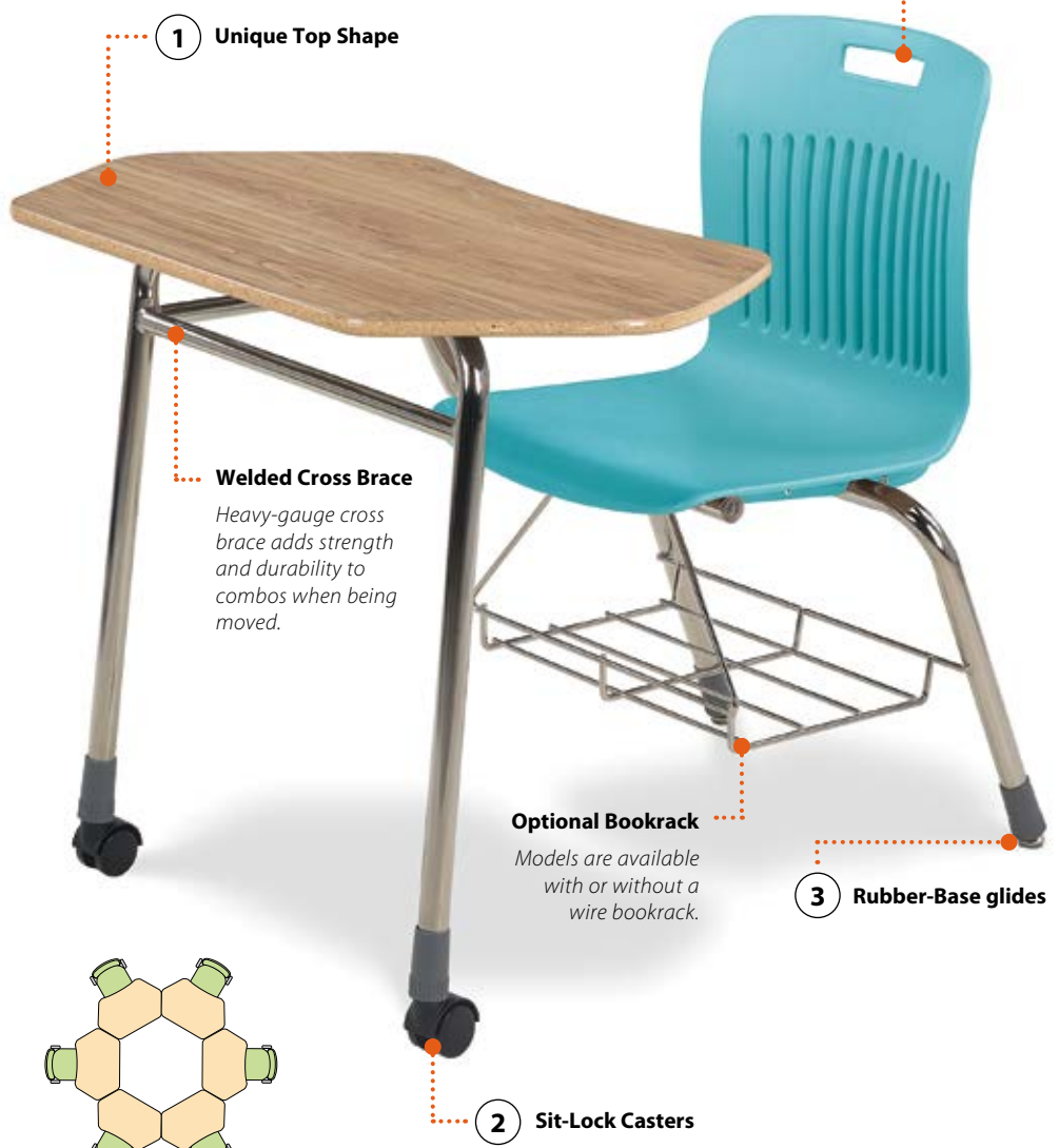
1 Unique Top Shape

Easy to Handle All three seating styles have a convenient hand hold making it easy to grab and go.