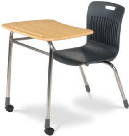
Analogy™ Agile Combo