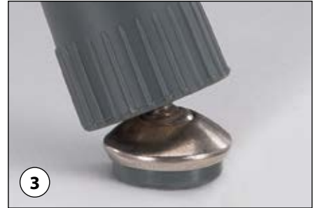
3 Rubber-based rear glides ensure that the combo unit stays firmly in place until it's lifted for moving.