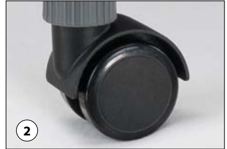
2 Twin-wheel, nylon casters are what make these units truly agile. Their dual surface design delivers smooth movement when you need it and the "sit-lock" feature secures the unit in place when the seat is occupied.