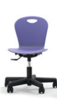
ZTASK15 Grade 1-4