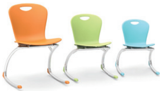
ZROCK18 Grade 5 & up