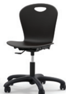
ZTASK18 Grade 5 & up