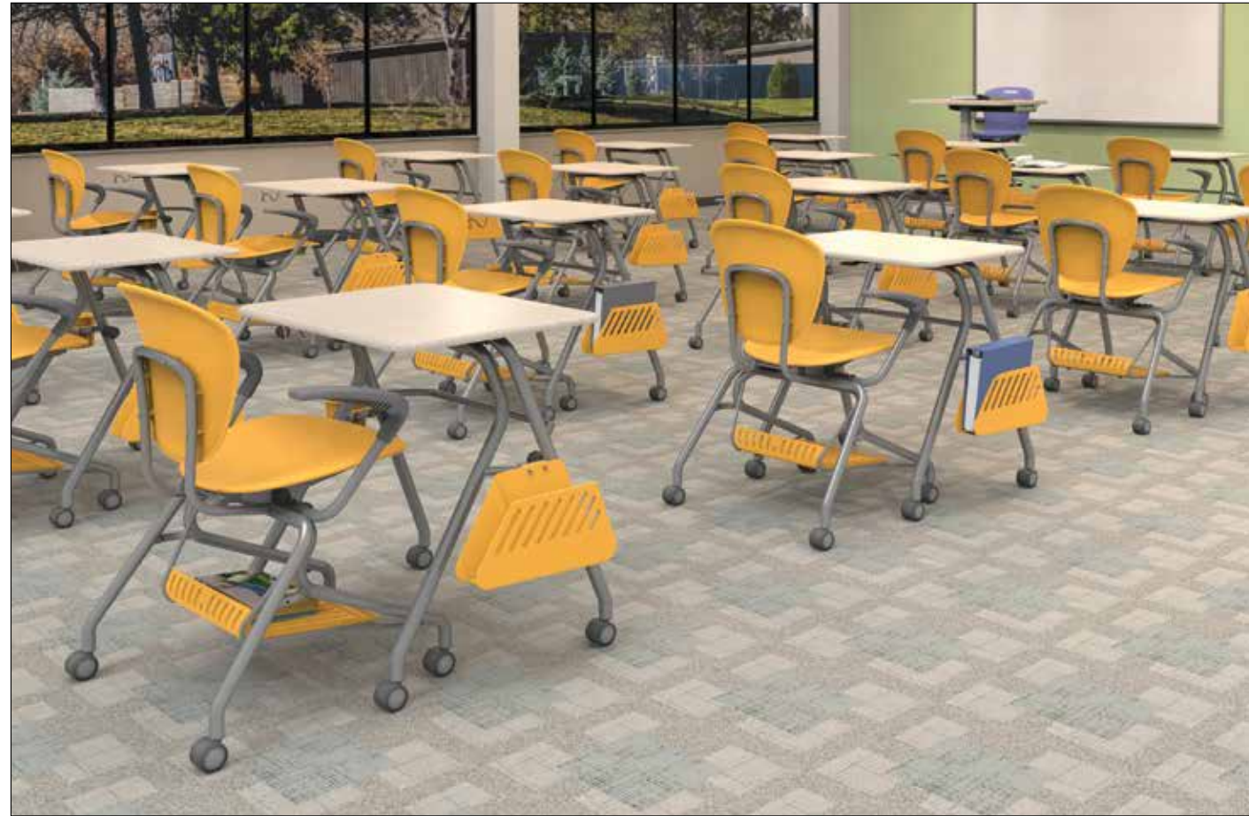
Set up in rows for teacher-focused learning

YOZI transforms classrooms into active spaces where students and teachers can shape how they learn, teach and collaborate. Rearrange for group work, line up for lectures, or nest everything aside to open the room.