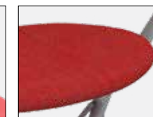
Padded Upholstered Seat