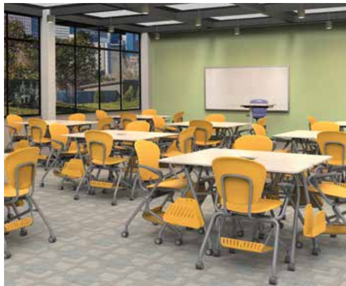
Reconfigure easily for group collaboration