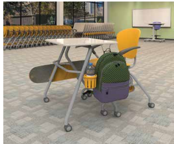
Flip, nest, and roll away to open the space